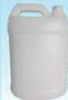
5 Ltr. Can