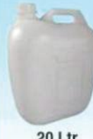
20 Ltr. Baida Can