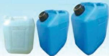
10 Ltr. 20 Ltr. 35 Ltr. Can