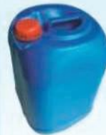
25 Ltr. Polycan