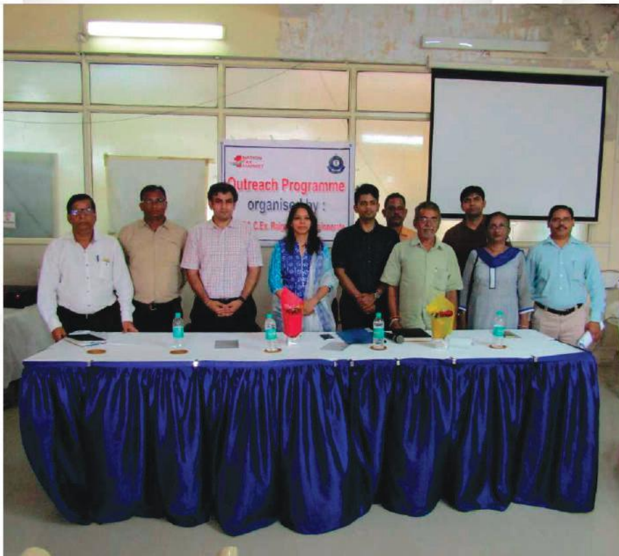
Group Photo to GST, Raigad Commissionerate Team & TMA Managing Committee