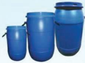
30 Ltr. / 50 Ltr. / 90 Ltr. Full Open Top Drum