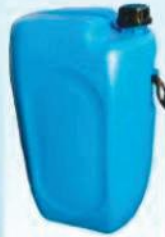
50 Ltr. Rocket