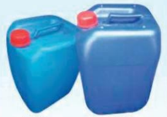
25 Ltr. 35 Ltr. Stackable Jerrycan