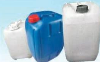
10 Ltr. 15 Ltr 20 Ltr. Sq. Can