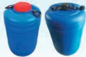
50 Ltr. Round Drum Narrow Mouth / Wide Mouth